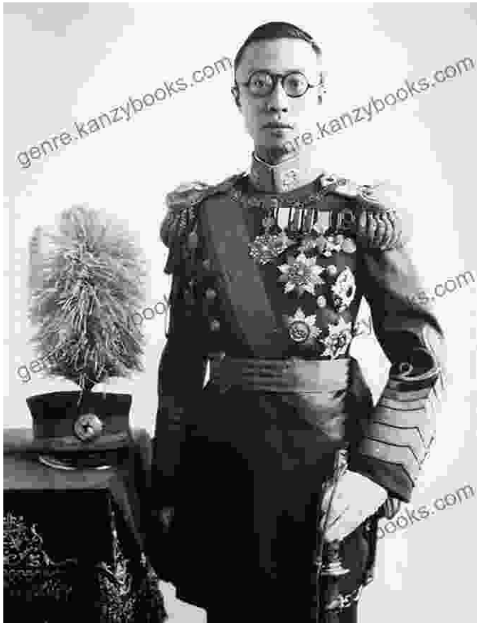
Pu Yi, the enigmatic last emperor of the Qing Dynasty

China Last Empire chronicles the rise and fall of the Qing Dynasty, the last and longest-ruling imperial dynasty of China. From the humble beginnings of Manchuria to their conquest of the Middle Kingdom, the Qing emperors presided over an era of unprecedented prosperity and territorial expansion.