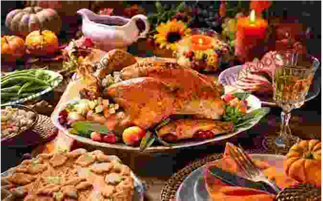
A traditional Thanksgiving feast, complete with turkey, stuffing, mashed potatoes, and pumpkin pie