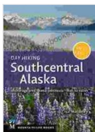
Image alt: A hiker stands on a mountain summit, surrounded by a panoramic view of snow-capped mountains, pristine lakes, and dense forests.

Don't let this opportunity to explore the Alaskan wilderness pass you by. Free Download your copy of 'Day Hiking Southcentral Alaska' today and begin planning your unforgettable journey. Immerse yourself in the pristine beauty of Southcentral Alaska, discover hidden trails, and create an adventure that will leave an enduring legacy in your heart. The Alaskan wilderness awaits your footsteps; let 'Day Hiking Southcentral Alaska' guide your path.