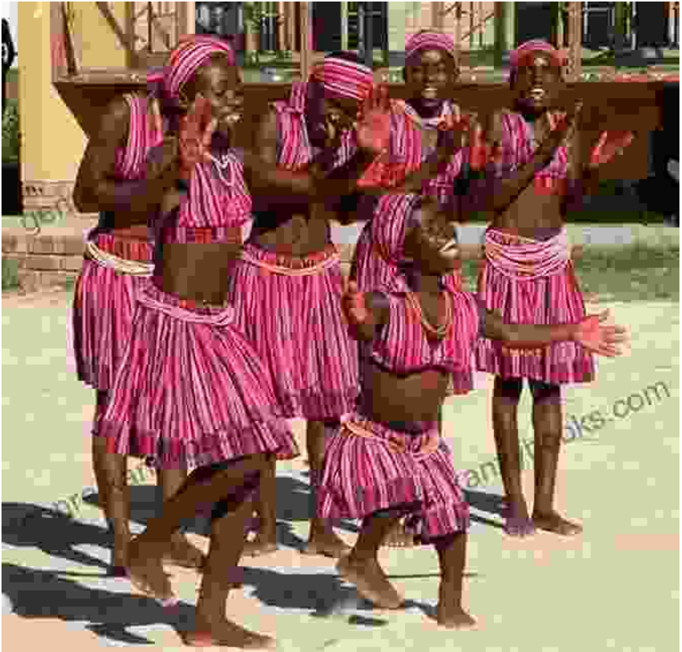
A traditional dance performance