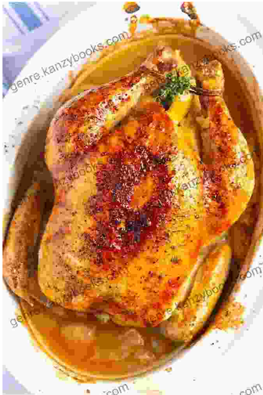
Roasted Chicken with Vegetables