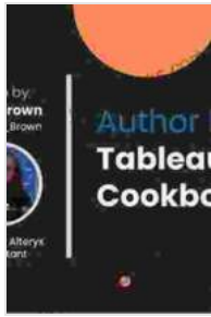
Tableau Desktop Cookbook by Lorna Brown