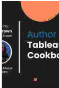
Tableau Desktop Cookbook by Lorna Brown

Unlock the Power of Visual Analytics with Tableau Desktop Cookbook: A Comprehensive Guide for Visual Analytics.