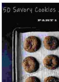
Image Alt Attribute: A close-up of a plate filled with a variety of savory cookies, including Cheddar Cheese Crisps, Meyer Lemon Parmesan Cookies, and Sun-Dried Tomato and Herb Biscotti.